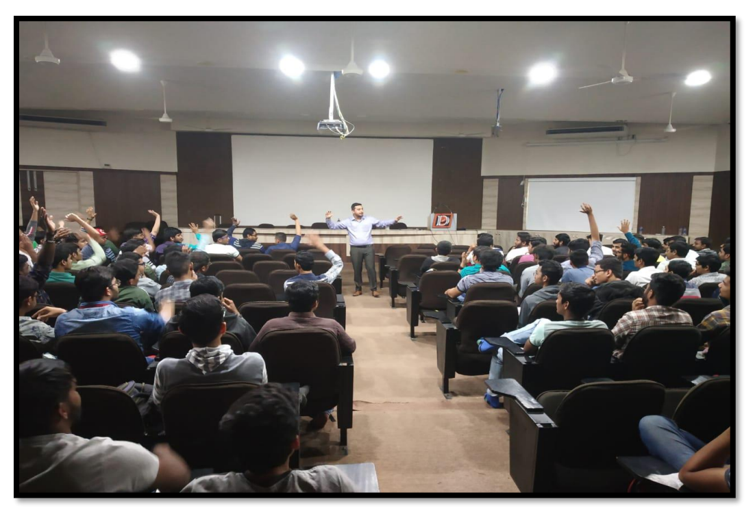
EXPERT LECTURE ON ELECTRIC FORMULA RACE CAR