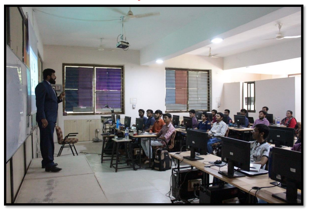
LEAN SIX SIGMA GREEN BELT PROGRAM (2018-19)